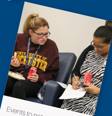
Events to network with other students, staff, and faculty