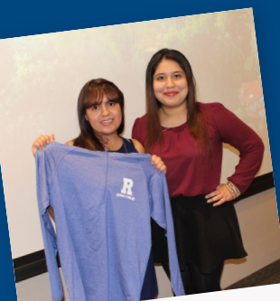
Undergraduate research experience

David T. Kearns Center for Leadership and Diversity in Arts, Science and Engineering